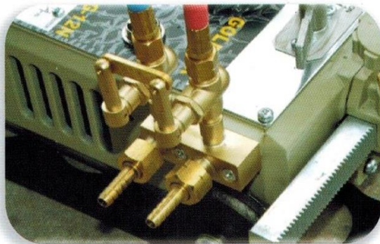
One Touch Valve - For Easy Cutting Setting