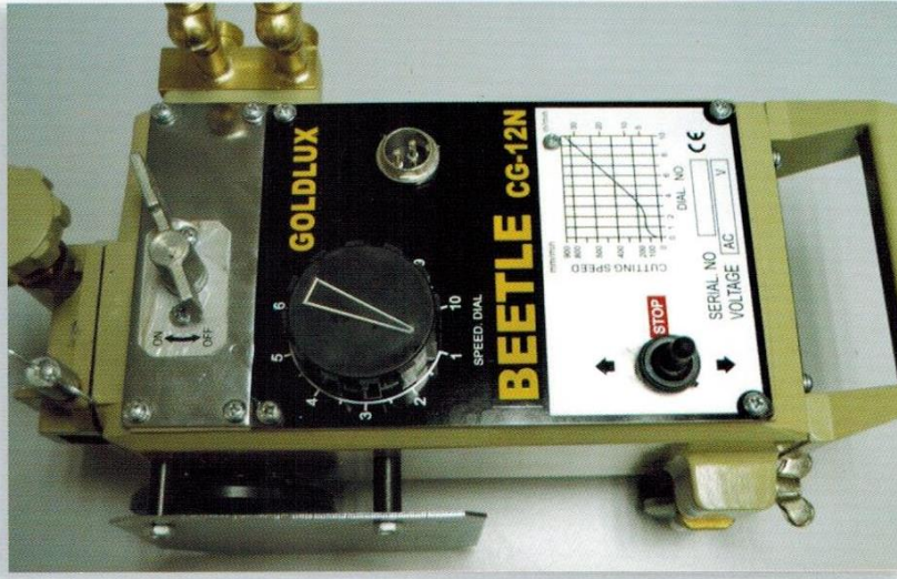
Model : IK 12 Reliable Straight Line Gas Cutting Machine With One Touch Valve And 6 Feet Rail